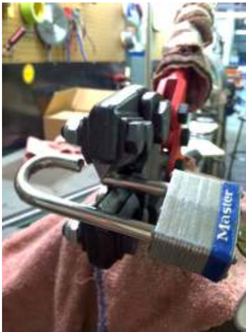
This shows our tool cutting through a Master Lock made of hardened steel. It cut through it like butter!

Along with having three durable blades, it has a built in adjustment that can fine tune the blade clearance, it can separate more or draw closer depending on what you need to cut. Another great factor of our product is everything is bolted together so instead of having to replace the entire thing you only have to replace parts, its saves you money and time. Along with all of that our jaws open much wider than our competitors so you can cut larger items with no problem.