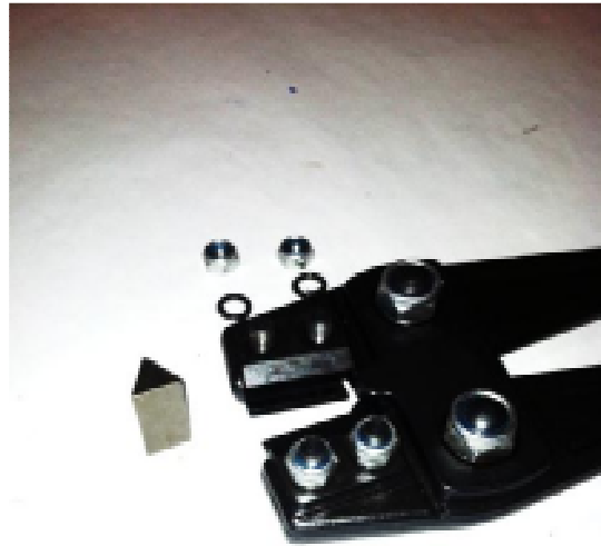
Above you can see we took out the blade to show you all three sides and how easy it is to remove and change.