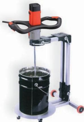
Optional BNR6001 Adjustable Mixer Stand

Mixing Capacity 3 bags - 25 Gallons Up to 120 lbs. of liquid material