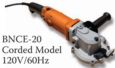
BNCE-20 Corded Model 120V/60Hz