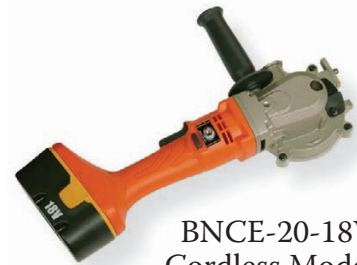
BNCE-20-18V Cordless Model

The Cutting Edge Saw™ has a unique flush-cutting blade guard that greatly reduces blade exposure. It also has a double insulated power harness and is ETL Certified & Listed.